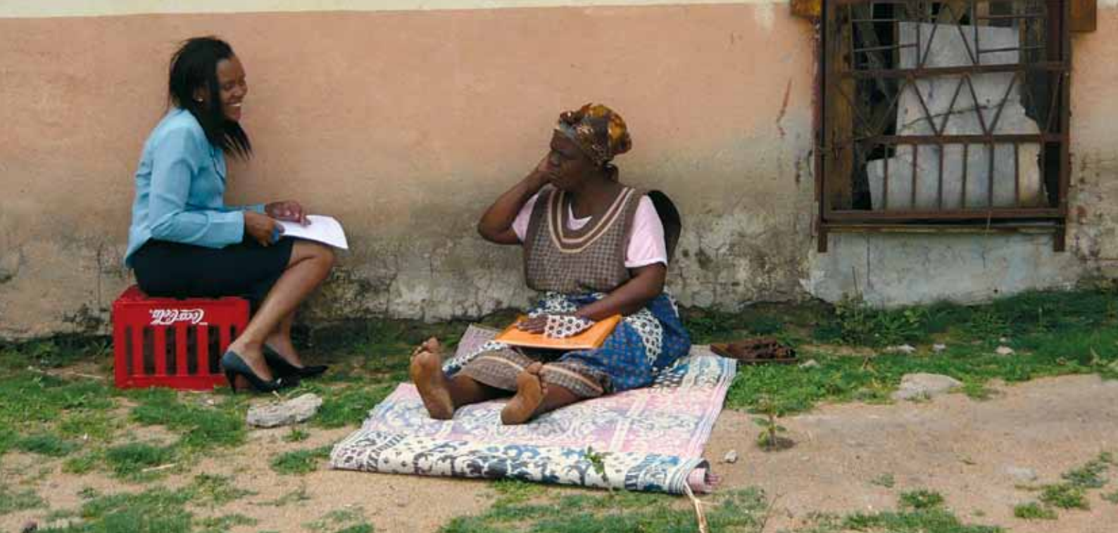
SWAPOL member interviewing a women in Sigwe.